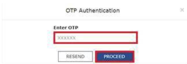
Figure 4: Entering of OTP

29 Enter the OTP in the OTP Authentication box and click the PROCEED button.