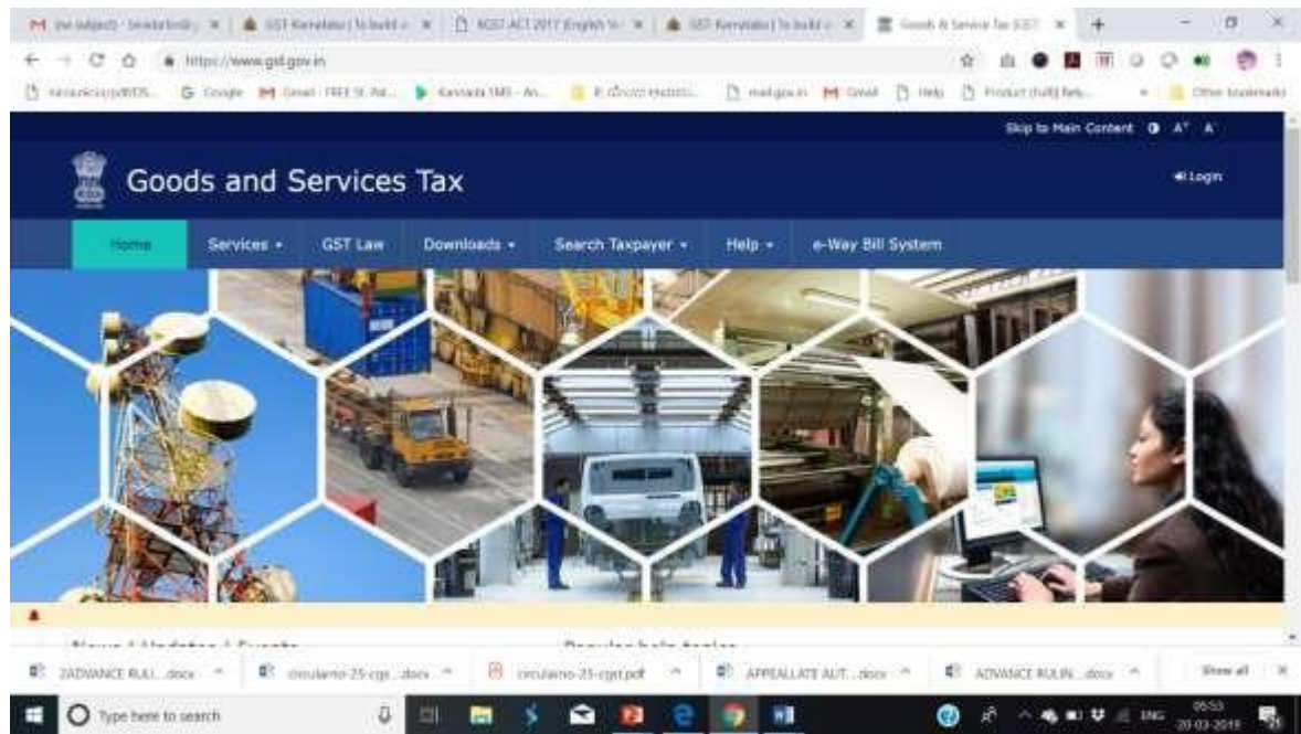
Figure 1 Common portal: www.gst.gov.in

25 Enter the GSTIN or ID created by you for Advance Ruling or GSTIN in the GSTIN/ Other Id field.